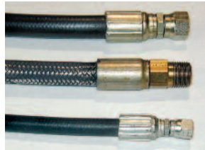
▶ Double Wire Braid Hose