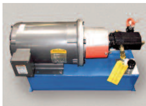
▶ Power Unit