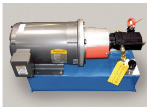
▶ Power Unit