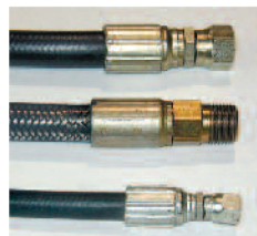
▶ Double Wire Braid Hose