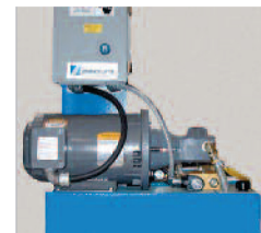
▶ Power Unit