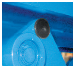
▶ Platform Centering Device