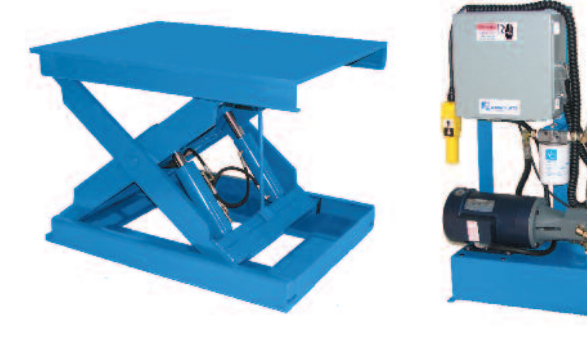
2,500 lb. Capacity - 18 in. Travel

Min. Platform Size: 36 x 36 in. Max. Platform Size: 48 x 48 in. Max. End Capacity: 2,500 lbs. Loading Side Capacity: 2,500 lbs. Baseframe Size: 36 x 36 in. Lowered Height: 9.5 in. Raised Height: 27.5 in. Approx. Speed Up: 11.5 FPM