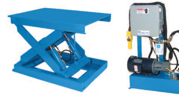
2,500 lb. Capacity - 31 in. Travel

Min. Platform Size: 36 x 48 in. Max. Platform Size: 48 x 60 in. Max. End Capacity: 2,500 lbs. Loading Side Capacity: 2,500 lbs. Baseframe Size: 36 x 48 in. Lowered Height: 9.5 in. Raised Height: 40.5 in. Approx. Speed Up: 11.5 FPM