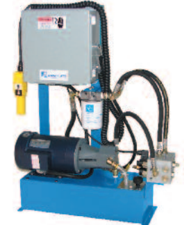
4,000 lb. Capacity - 18 in. Travel