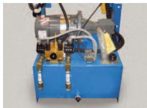
▶ Power Unit w/Controller