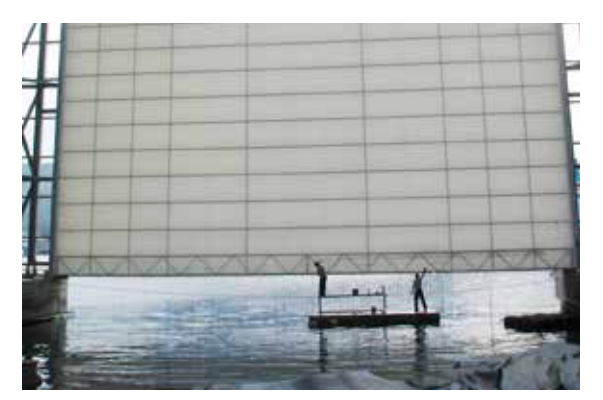
Megadoor vertical lifting fabric doors are the ideal solution for enclosed berths or dry docks.