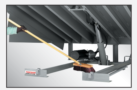
CleanSweep Frame Design.