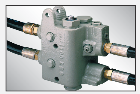
Fluid Logic Block controls the flow of hydraulic fluid.