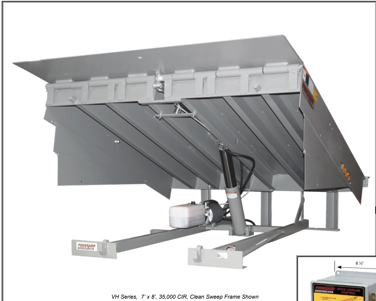
VH Series, 7' x 8', 35,000 CIR, Clean Sweep Frame Shown