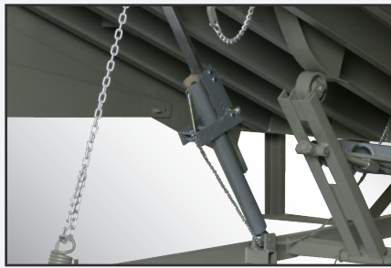
Heavy-duty, extended range, float barrel hold-down mechanism.