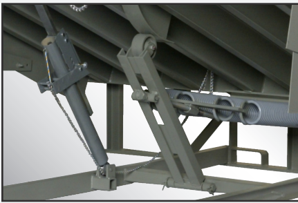
Cam Control Counter Balance Assembly permits smooth ramp extension and easy walk-down of the leveler.