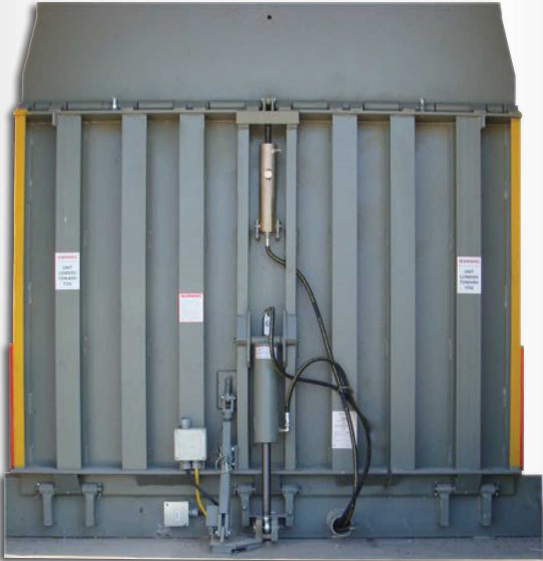
* VS Series 7'x6' 40,000 CIR, shown with remote motor and solenoids