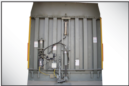
Extended service range with Poweramp's low profile/wide flange structure.

The Poweramp VS Series Vertical Storing hydraulic leveler offers unmatched environmental control for temperature sensitive applications. Designed with the highest level of strength, security and safety make the VS an excellent choice for any advanced loading dock operation.