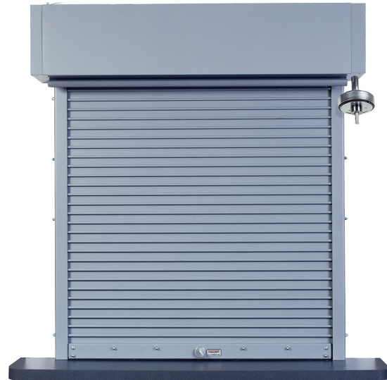
FireCurtain UCP model shown