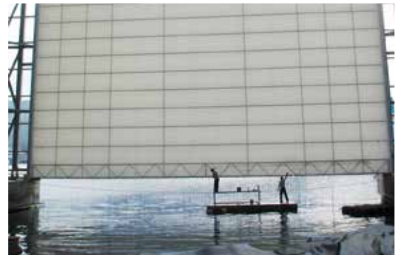
Megadoor vertical lifting fabric doors are the ideal solution for enclosed berths or dry docks.