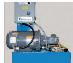
▶ Power Unit