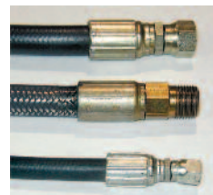
▶ Double Wire Braid Hose