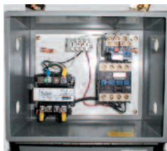
▶ UL Listed Control Panel