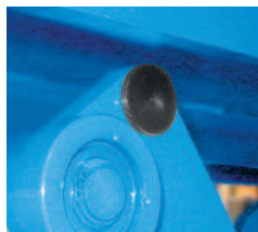
▶ Platform Centering Device