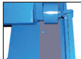
▶ Replaceable Roller Wear Strip