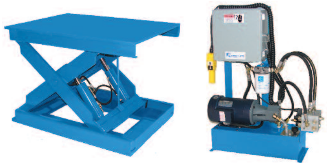
2,500 lb. Capacity - 18 in. Travel