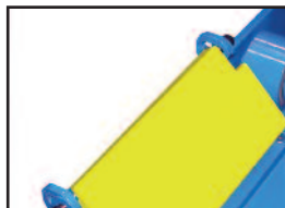
▶ Hinged Maintenance Device