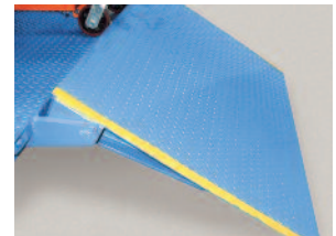
▶ Combination Wheel Chock/Ramp